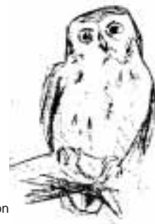
Illustration by Kirsten Munson

Participants: 24 Parties: 12 Party hours: 30