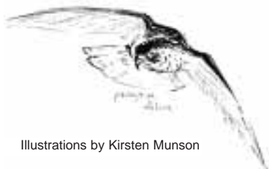
Illustrations by Kirsten Munson

Send your comments to: Illinois Department of Natural Resources Endangered Species Protection Board One Natural Resources Way Springfield, IL 60207