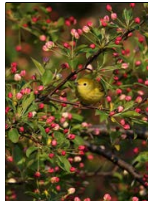
Yellow Warbler.