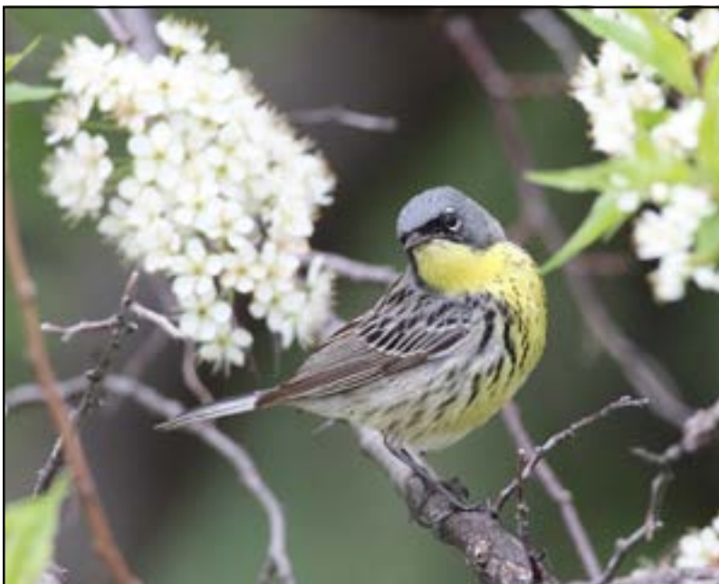
Kirtland's Warbler.