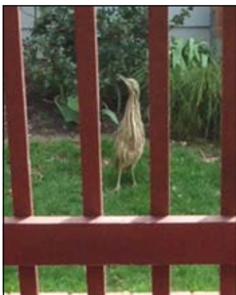
American Bittern.

3rd Place: Chicago Botanic Garden's "Day in the Garden Package"