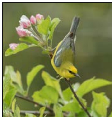
Blue-winged Warbler.

Park at Bemis Woods North, eastern-most part of parking area, just west of Wolf Road. Leader is Douglas Stotz ( dfstotz@gmail.com ).