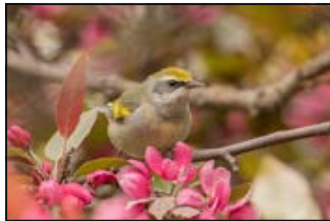
Golden-winged Warbler.

Wednesday, June 21 (8:00 a.m.). Chicago Audubon Bemis Woods Field Trip, Bemis Wood North, Wolf Road between 31st and Ogden, Westchester. Look for songbirds, especially warblers, vireos, flycatchers, thrushes and sparrows plus resident