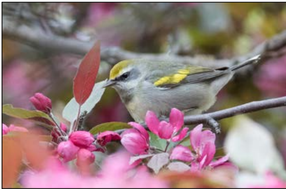
Golden-winged Warbler.

present, along with representatives of many other partner organizations. The event is part of the "Chicago Urban Treaty Project," generously funded through the National Fish and Wildlife Foundation's Five Star & Urban Waters Restoration Program through funding provided by the U.S. Fish and Wildlife Service's Urban Bird Treaty Program. For more information, a map, and the list of partner organizations go to: www.fpdcc.com/event/international-migratory-bird-day-celebration or call 708-386-4042, or email experience.nature@cookcountyil.gov . LaBagh Woods is located at 5400 North Cicero Avenue, at the intersection of Cicero and Foster. Bring family and friends!