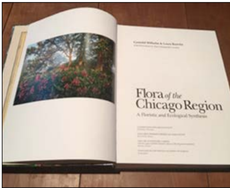
Flora of the Chicago Region: A Floristic and Ecological Synthesis will be available for purchase in mid April at indianaacademyofscience.org . The book will also be available late April at the Morton Arboretum bookstore.

these books were designed in to add to their usefulness.