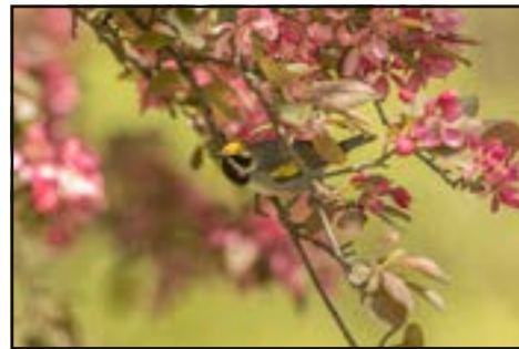
Golden-winged Warbler.