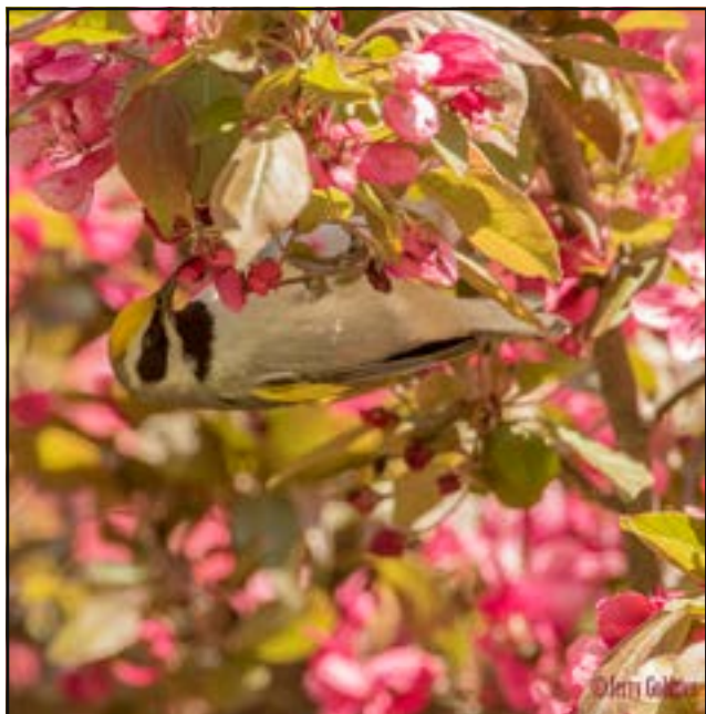
Golden-winged Warbler.

As we announced in the last issue, we will be going digital with this newsletter sometime this year. If you have never sent us your email address and wish to receive a link to each new issue every two months by email, please send your email address to our office at: cas@chicagoaudubon.org . The cost of printing and mailing the newsletter in the current form is one of our major expenses, and we want to apply those funds more directly to conservation projects. Please remember, all issues of the Compass can always be viewed on our website ( chicagoaudubon.org ). Click on the word "Newsletter" in the top row of tabs on the homepage. There you will see the archives of all our issues in "living color."