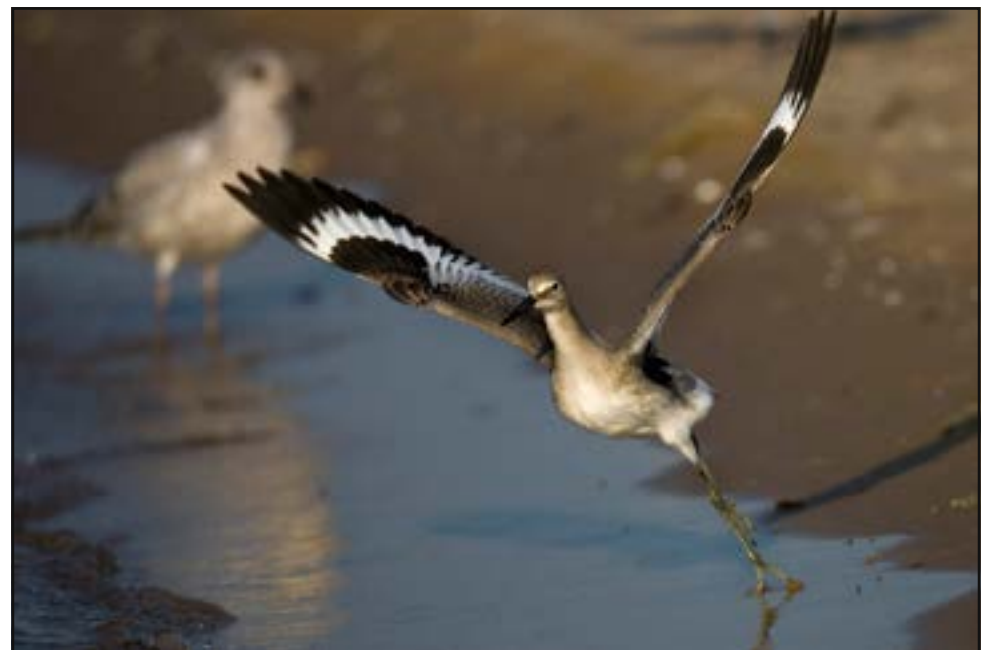
Willet.